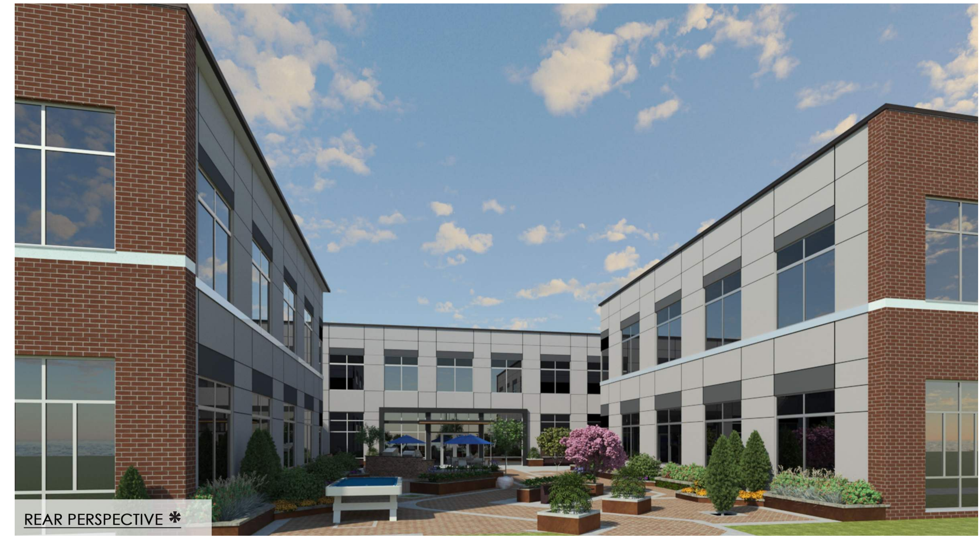
REAR PERSPECTIVE *