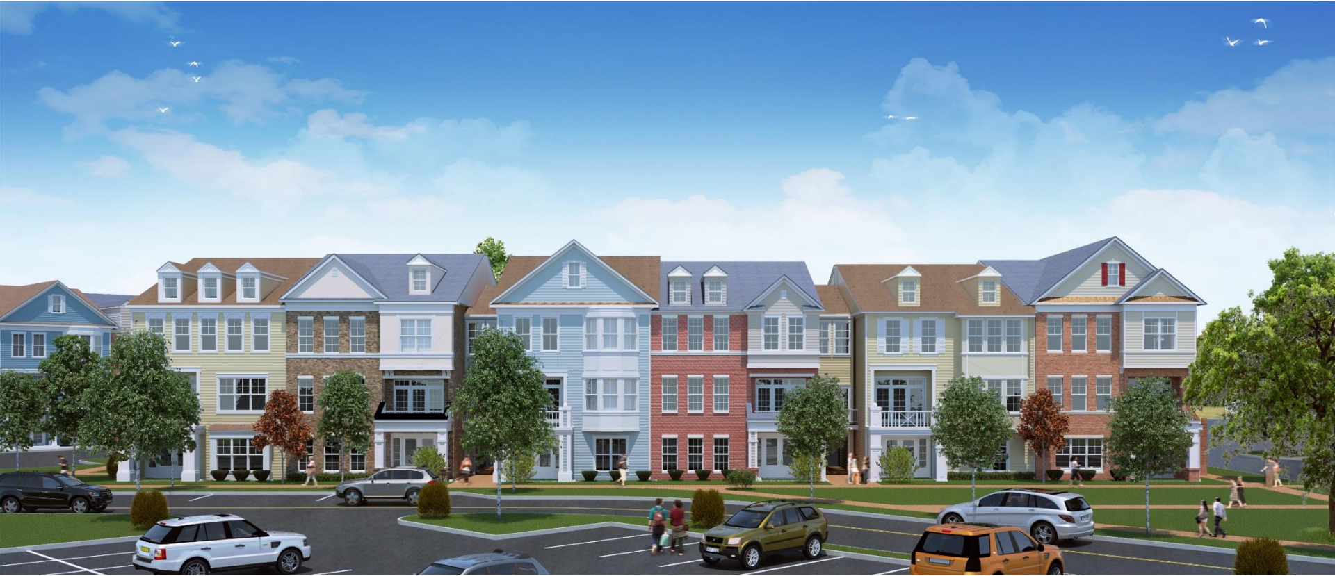
BUILDING TYPE A FRONT ELEVATION