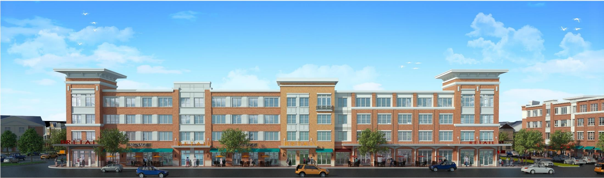
BUILDING 1 (VIEW FROM PARKWAY AVENUE)