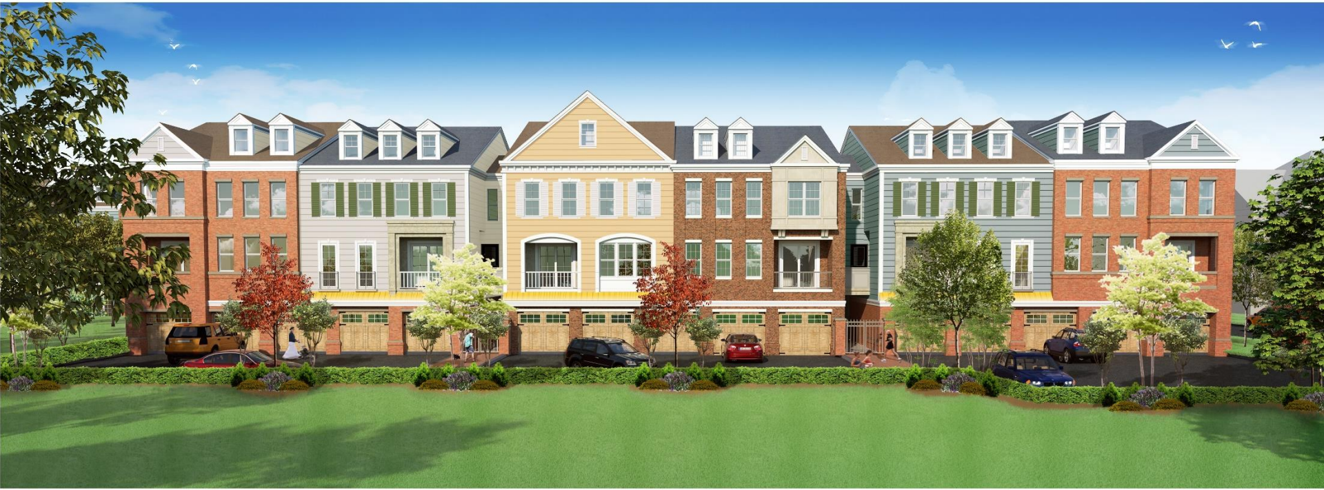
BUILDING TYPE B REAR ELEVATION