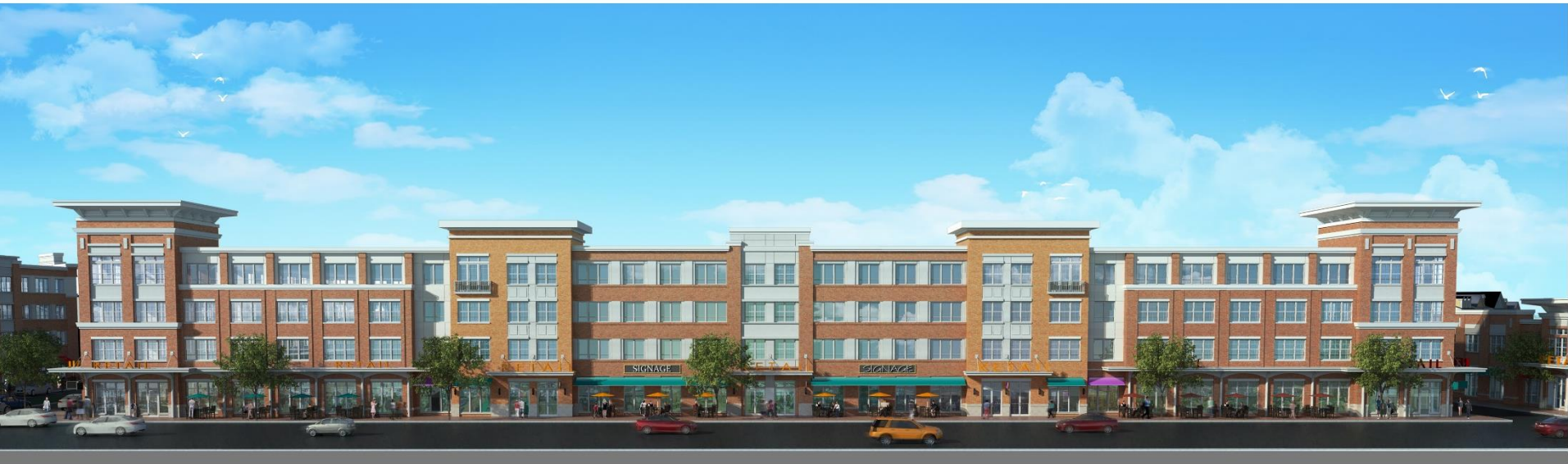
BUILDING 2 (VIEW FROM PARKWAY AVENUE)