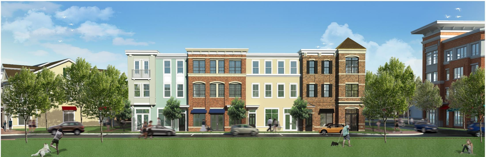
4 UNIT LIVE & WORK BUILDING (VIEW FROM COMMUNITY GREEN)