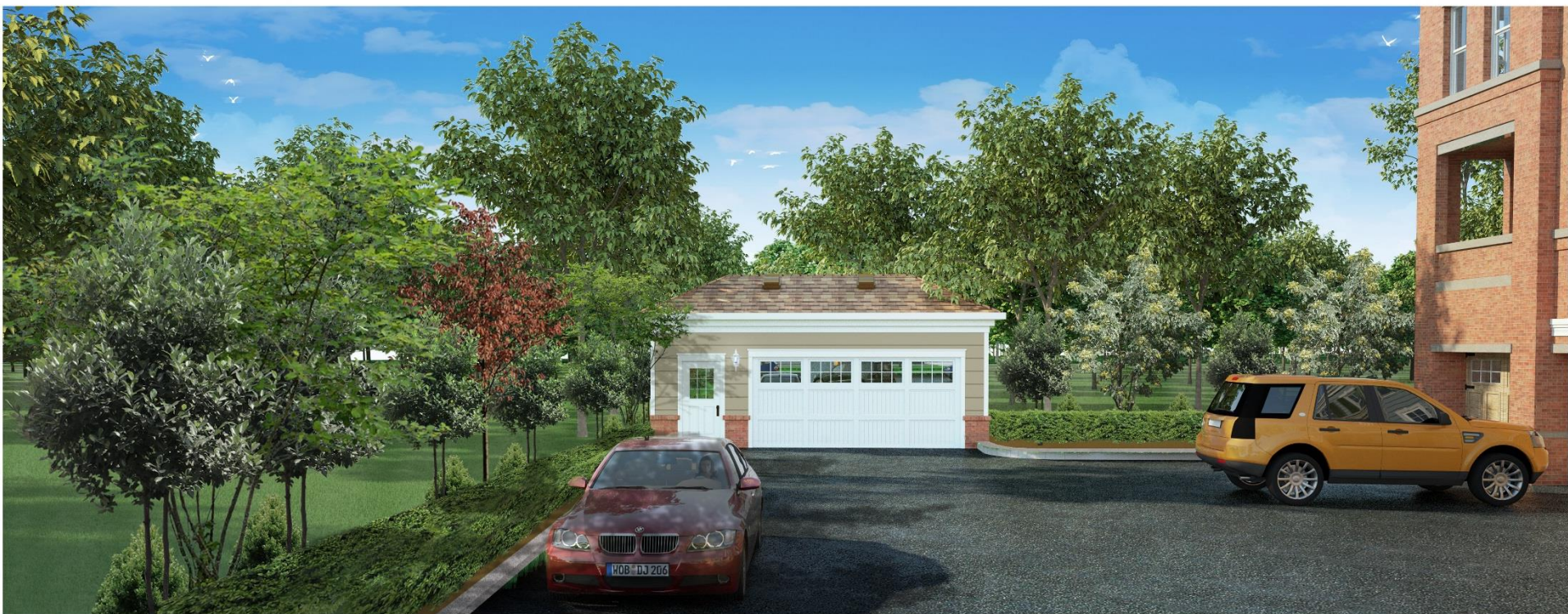
DUMPSTER ENCLOSURE ELEVATION