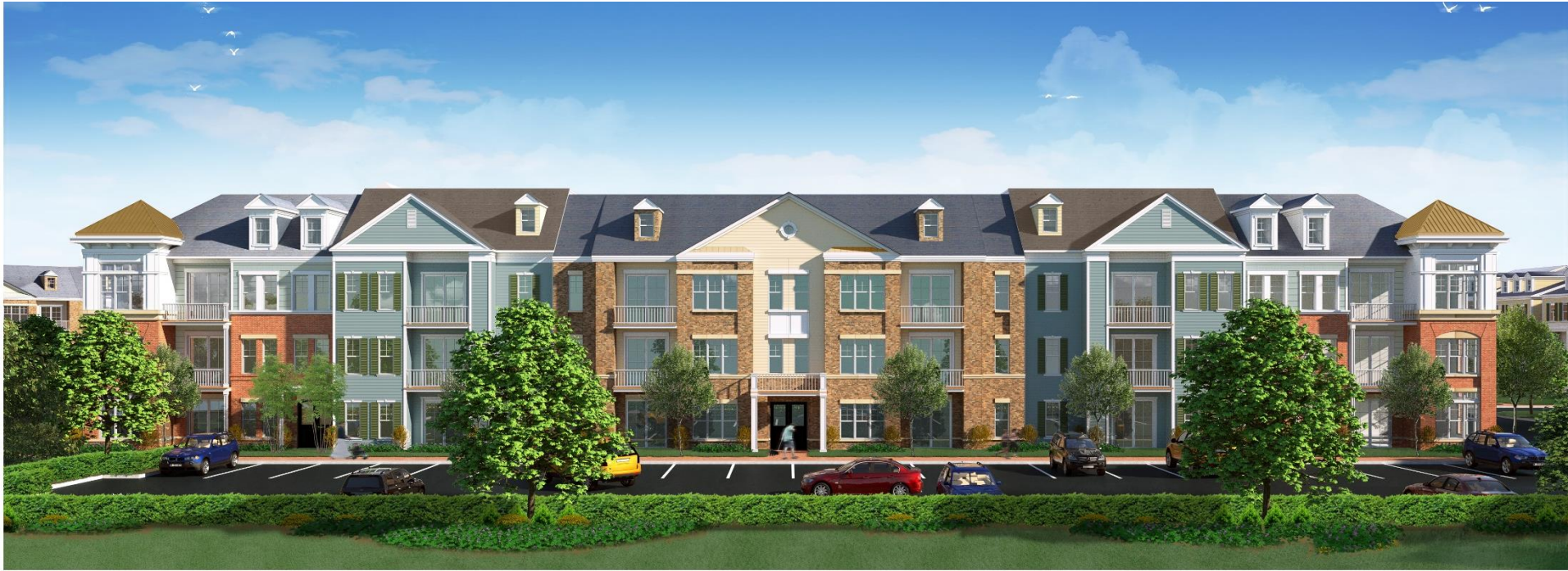
BUILDING TYPE C FRONT ELEVATION