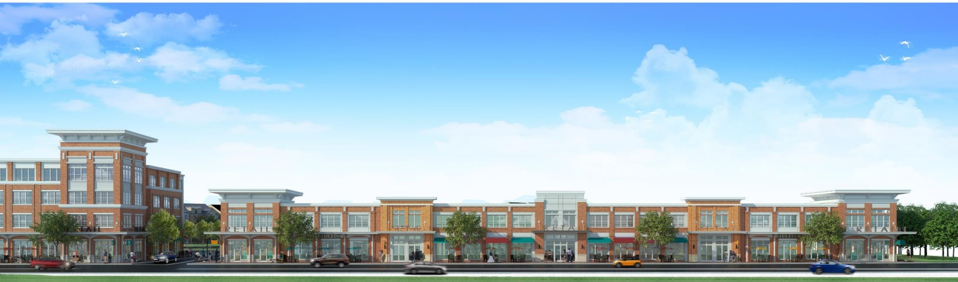
BUILDING 3 (VIEW FROM PARKWAY AVENUE)