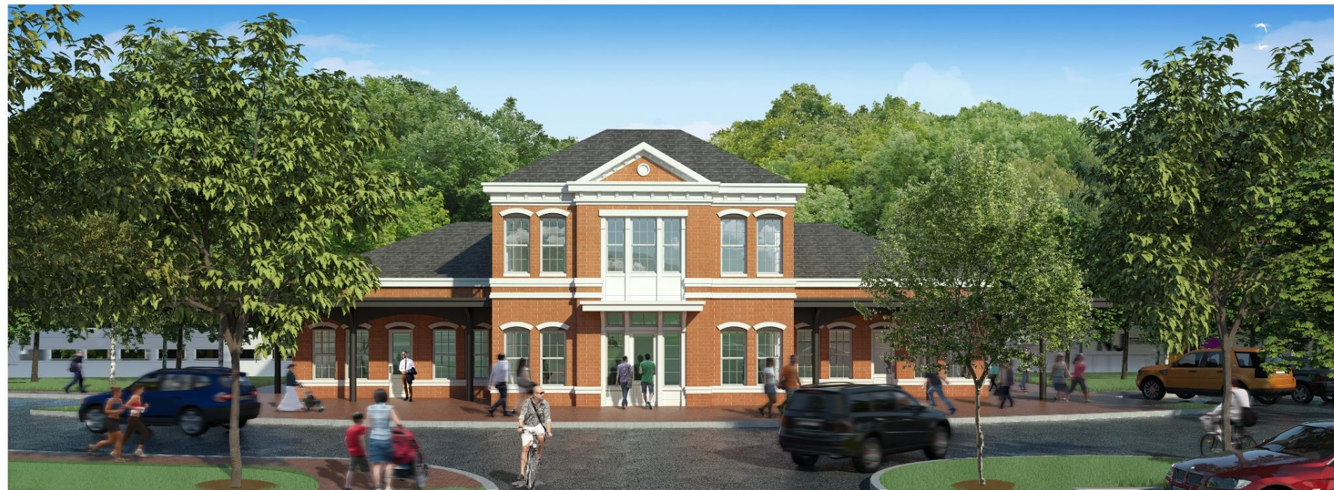
PROPOSED TRAIN STATION