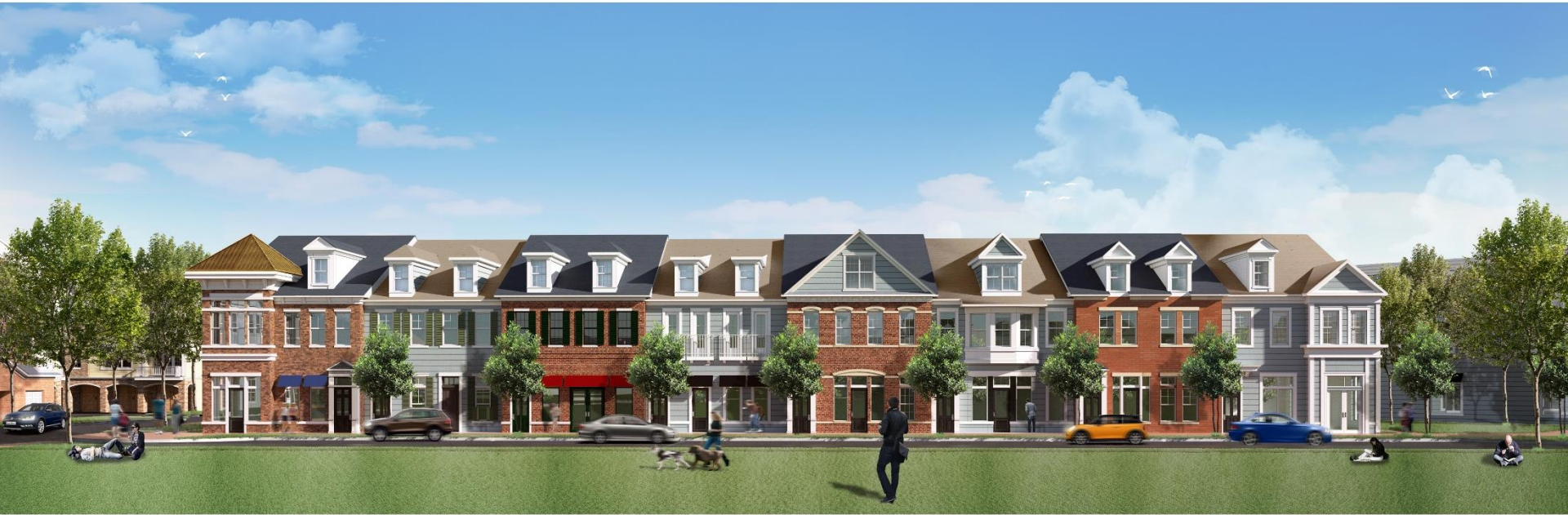
8 UNIT LIVE & WORK BUILDING (VIEW FROM COMMUNITY GREEN)