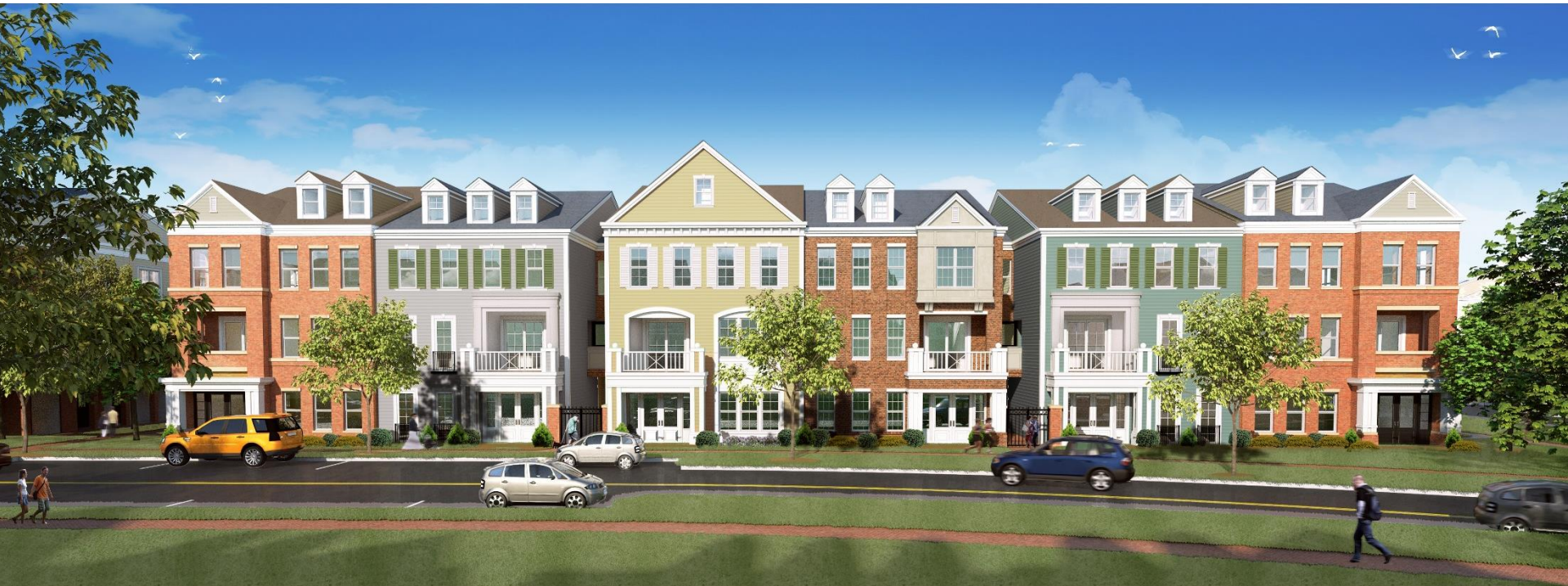
BUILDING TYPE B FRONT ELEVATION