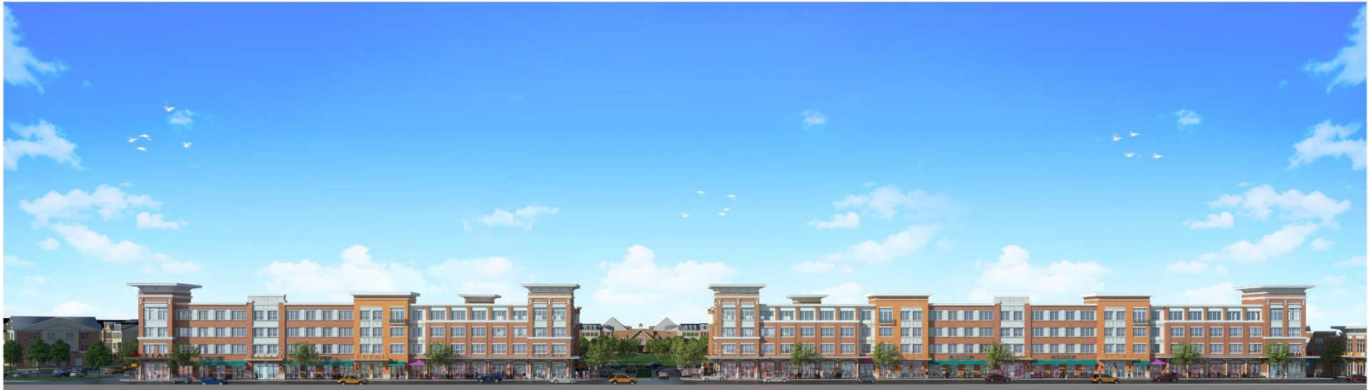
PARKWAY AVENUE ELEVATION