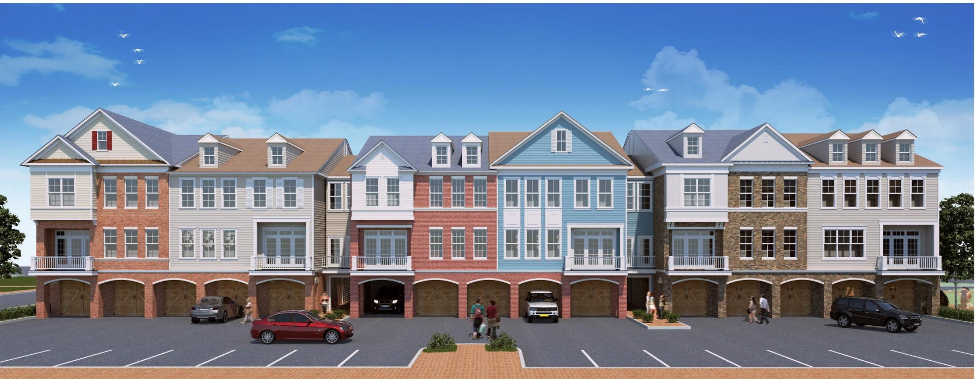
BUILDING TYPE A REAR ELEVATION