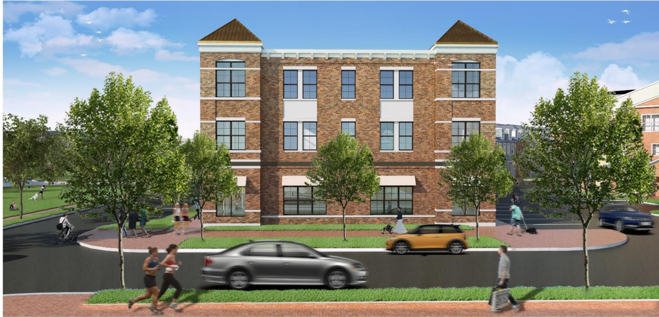
4 UNIT LIVE & WORK BUILDING (VIEW FROM RETAIL BUILDING)