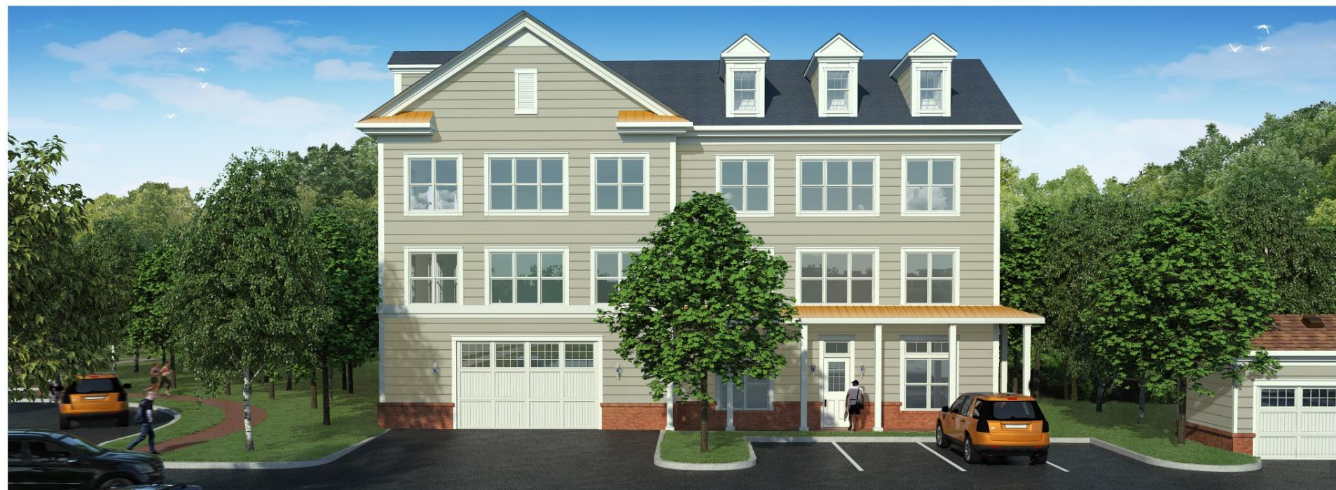
PROPOSED MAINTENANCE BUILDING